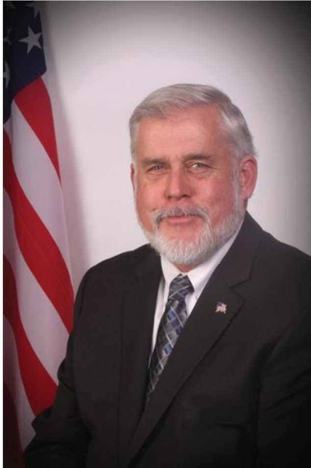
Glendale Mayor Jerry Weiers